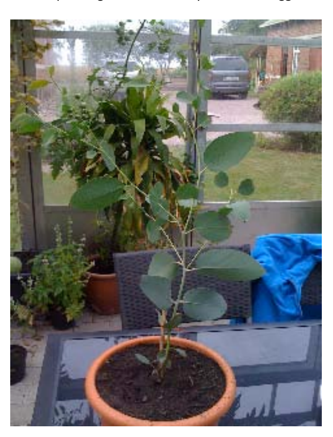
Olle's Snow-gums in Humlarp, Sweden

The weather in Humlarp is very different to Australia, with winter average temperatures around zero, and summer averages at about 15 degrees. To my surprise, the Snow-gums, Eucalyptus pauciflora, did well and he had quite a few healthy young seedlings in his glass-house by the northern summer of 2010. He decided to try a couple in the garden, but the 2011 winter was very cold, and they did not survive. However, he still has a few inside and plans on transplanting them when they are a little bigger.