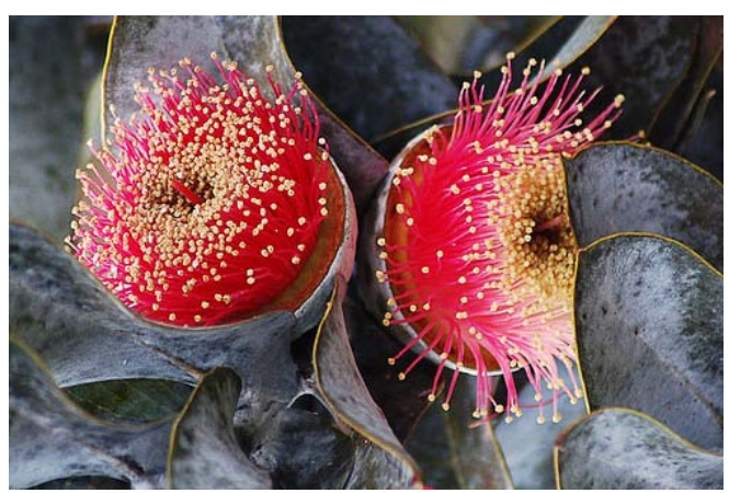
Eucalyptus macrocarpa - Mottlecah