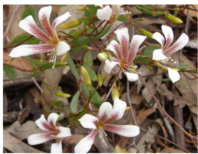
Billardiera bicolour- Painted Billardiera

encyclopaedia, found that some are small shrubs. There are some 25 species, many from WA, and some are very striking in flower. I have only grown B. ringens and B. bicolour , both climbers, and they prefer good drainage and dappled to full sun but are otherwise fairly reliable.