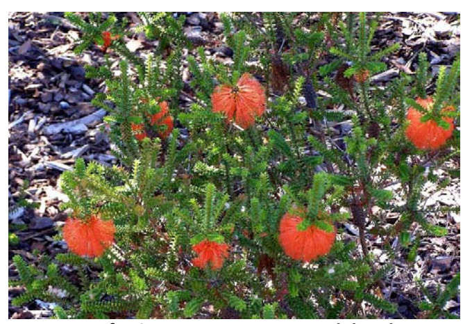
Beaufortia sparsa – Swamp Bottlebrush

Beaufortia This is a small WA genus of some 18-20 species, closely related to the melaleucas and callistemons. They are not common in eastern Australian gardens although a couple such as B. purpurea and B. orbifolia seem to be reliable in well drained soils and near full sun situations, forming neat shrubs to around 2 m. The most spectacular is the orange-red flowering B. sparsa which is fairly fussy needing soils that do not dry out (in WA it supposedly grows in swamps) but beautiful in flower. The attached picture was taken in the Dunedin Botanic Gardens in southern New Zealand, surely the most southerly location in which it has ever been grown!