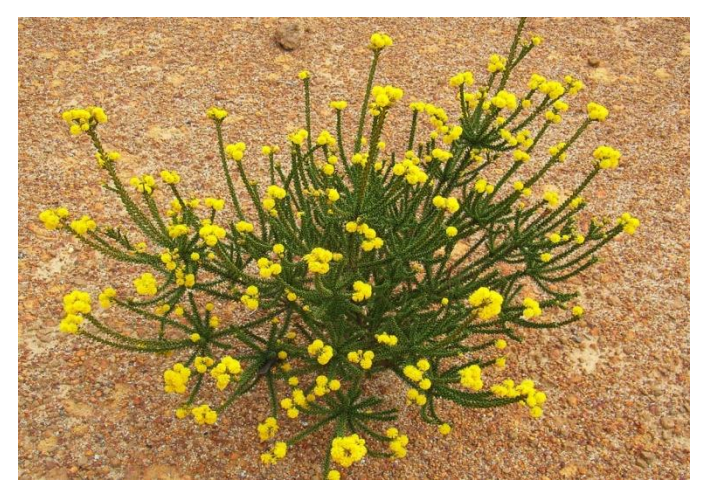
A. lasciocarpa, pulviformis and varia are all small plants that would look great in any garden. Above is

alphabetical order beginning with the Acacias