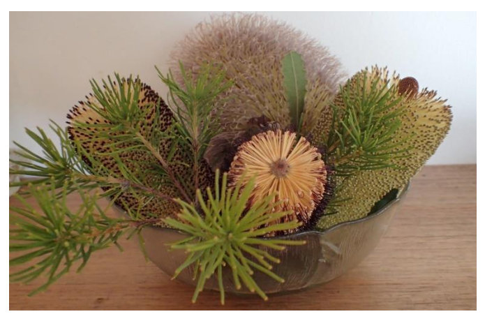
Banksias on display

The plant table was a little leaner than usual, but that is not unexpected as winter approaches. However, there were some great specimens, and Matt Leach talked us through them with a great deal of knowledge, and patience. And, as always, there were some interesting Banksias on show. Perhaps the most unusual is Banksia bauera, variously known as Woolly Banksia, Possum Banksia or Teddy Bear Banskia because of its very large, furry flower heads. Banksia conferta is a large shrub from eastern Australia with tall, cylindrical, yellow and purplish flowers. Banksia candolleana, the Propeller Banksia is so named because of the arrangement of its long, serrated leaves. orange/yellow flowers appear in late Autumn. Banksia spinulosa has many varieties, Birthday Candles for example, and is common in local gardens.