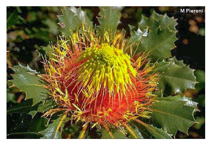
Dryandra quercifolia

D. longifolia is a bushy shrub to about 3m with long, sharply pointed, serrated leaves and terminal yellow flowers. Tony's specimen is over forty years old. D. quercifolia has pointed oak-like leaves and red and yellow flowers.