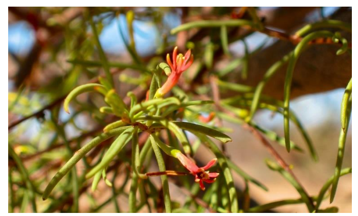
Mistletoe on a Grevillea striata near Little Topar NSW

But, will they? One poster disagreed and posted a link to a news story. I read it with interest and that lead to more research. Here's what I found out. Firstly, Melbourne City Council has deliberately infected healthy trees with mistletoes. Why?