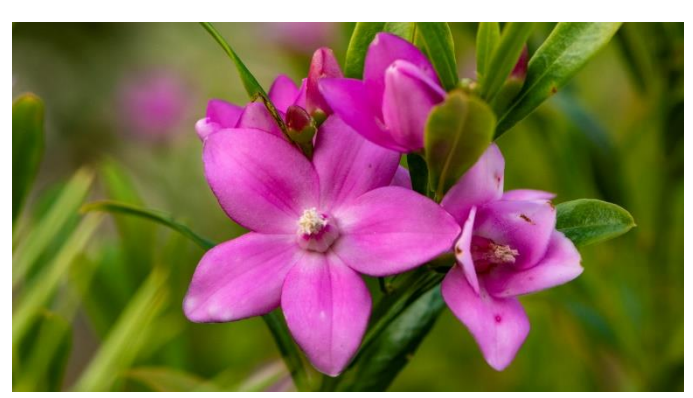
Crowea saligna 'Large Flower'

My plant is the cultivar known as 'Large Flower' for rather obvious reasons, and is just coming into full flower now. The flowers are usually about 2.5 cm, with five petals and are a bright vibrant pink. Flowering is from late autumn through winter and into early spring.