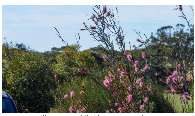
Grevillea petrophiloides near Toodyay WA.

Grevilleas always feature on our plant tables and tonight was no exception. Hybrids like 'Billy Bonkers', 'Peaches'n'Cream' and 'Superb' do well in our Mediterranean climate and always add colour to the garden. Grevillea magnifica and Grevillea petrophiloides grow their pink and green cylindrical flowers on the ends of very long stems, making them a feature plant well worth having.