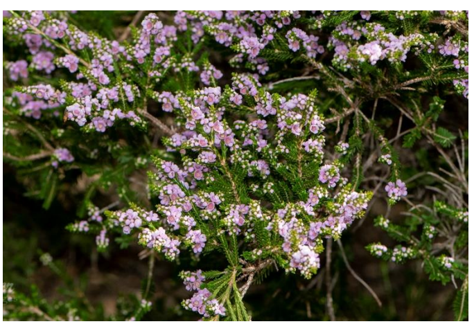
Thryptomene 'Roger's Mystery'

Thryptomenes are coming into flower at the moment and there was a large number and variety on display. Among them were T. saxicola , T. saxicola 'FC Payne', T. stenophylla , T. baeckeacea and T. stenophylla . Thryptomenes are compact shrubs with fine foliage and masses of tiny flowers ranging from white through pink, mauve to purple. Our own Roger Wileman 'found' a mystery Thryptomene seedling in his garden ... a mystery because he had never had one and wondered where the seed had come from. He cultivated and donated many plants from this mystery one and it, too, was on the table.