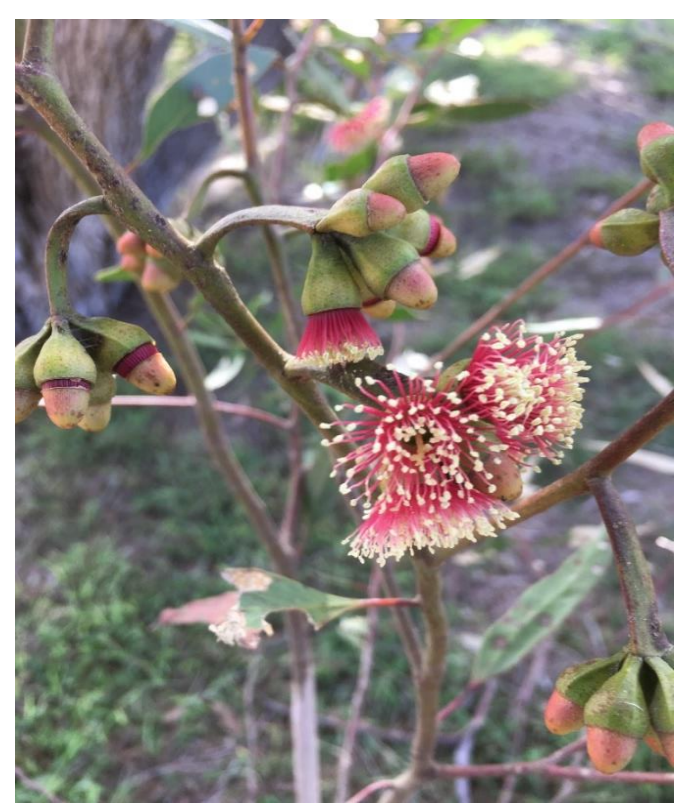
The 'mystery' plant in flower

So it was a pleasant surprise to note sprouting from the "dead stump". I have no idea how long the stump had been dormant. I was pretty thrilled when the sole surviving branch from that sprouting bore masses of beautiful flowers several years later.