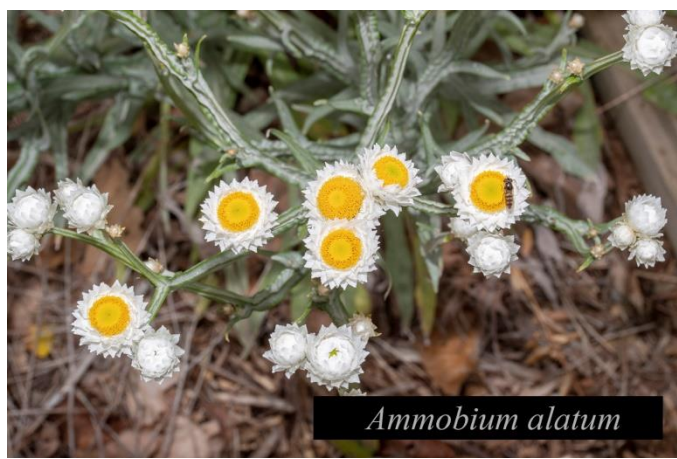
Ammobium alatum

There were a number of Asteraceae on display. Xerochrysum bracteatum is available in a multitude of colours. It's large and showy paper-daisy flowers make it a popular garden plant. Those on show were a vibrant gold, and a deep red with yellow centre. Trachymene coerulea , the Rottnest Island daisy is an erect perennial with bright blue, pin-cushion flowers. Ammobium elatum is another perennial plant, with silvery foliage and small but abundant papery white flowers with large golden, contrasting centres. It self-seeds very readily. (Frank Scheelings gave me a couple of these innocent-looking plants. They grew extremely quickly and produced flowers on metre-long stalks which tried to bite me every time I walked past. Plant at your peril!)