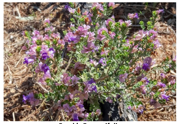
Frank's E. cuneifolia

It does not grow well in Victoria unless grafted, usually onto Myoporum sp. Stock. It responds well to pruning which helps to keep a compact shape. consists of a deep pink to purple corolla or tube, surrounded by colourful lighter pink sepals; after the flower falls, the sepals remain on the plant for a long time, continuing a colourful display. It is quite hardy, and tolerates dry conditions, but is very frost sensitive, so some thought needs to be given to its location in the garden, or it can be grown in pots where it will forgive neglectful gardeners who fail to water frequently.