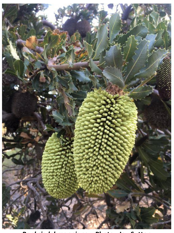
Banksia lehmanniana

Banksias are always a feature of our table with many members having an affinity for growing them. Among tonight's offerings was Banksia burdettii , a shrub with lovely orange and white flowers, similar to B. prionotes . Banksia praemorsa , the Cut-leaf Banksia is a beautiful ornamental shrub that usually features deep red flowers. Our specimen was of the yellow-flowered form. Banksia aculeata is a tall shrub with dense, prickly-edged leaves and pendulous, red/brown flowers, reminiscent of pine cones when in bud.