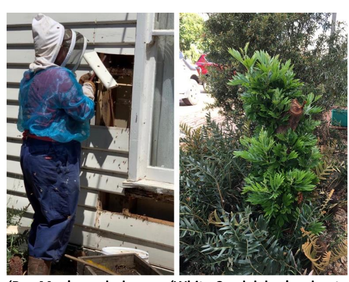
'Bee Man' wreaks havoc - 'White Candelabra' reshoots

Oh, and the painting went well, although I developed a nasty rash from touching the paintbrush. ©