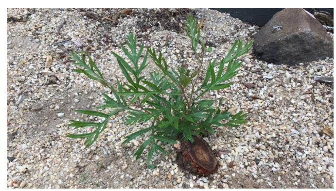
Grevillea 'Superb' ... from a ground-level stump

I've often been heard to wonder at the fickle nature of Grevilleas; their ability to be flowering profusely one day and be dead and dry two days later. But, not this time. Both my Grevilleas refuse to die, and though nothing was left but a stump, both have re-sprouted. To say I'm happy would indeed be an understatement.