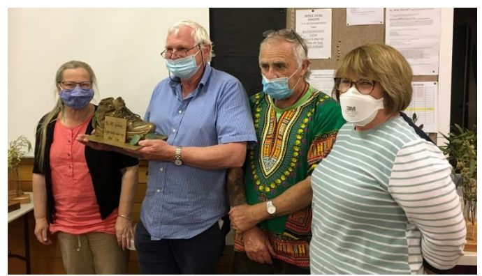
Our overall winners, 'The Rooting Hormones'

'The Pistils' won the Anatomy challenge, and 'The Rooting Hormones' took out the plant table challenge, Plant Bingo , and the overall Championship.