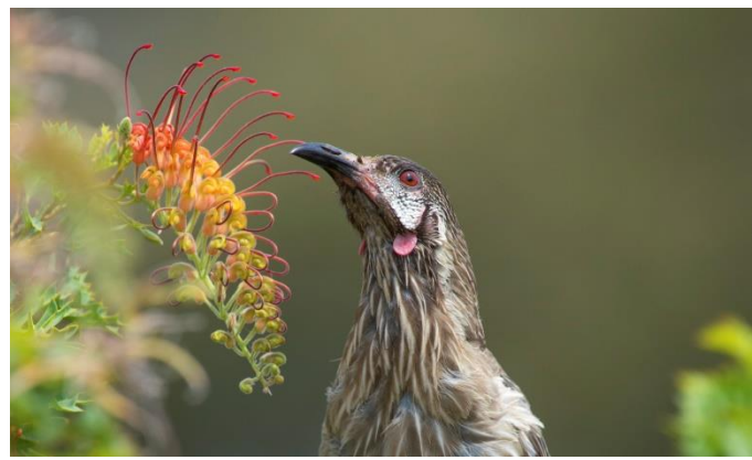
Red Wattlebird on Grevillea bipinnatifida

Grevillea bipinnatifida is a very variable Grevillea ranging in size and growth habit. There are two subspecies recognised. Along with G. banksii , it is a parent plant for many well-known garden hybrids. Native to the WA around the Perth region.