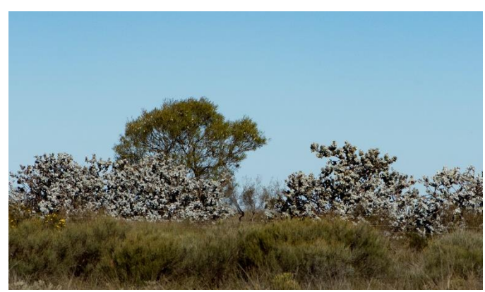
E. macrocarpa near Eneabba, WA

The name Eucalyptus is derived from the ancient Greek words 'eu' meaning 'good, well, very' and 'kalypto' meaning 'cover, conceal, hide' referring to the operculum covering the flower buds. The specific epithet is also derived from the ancient Greek - 'makros' meaning 'long' and 'karpos' meaning "fruit".