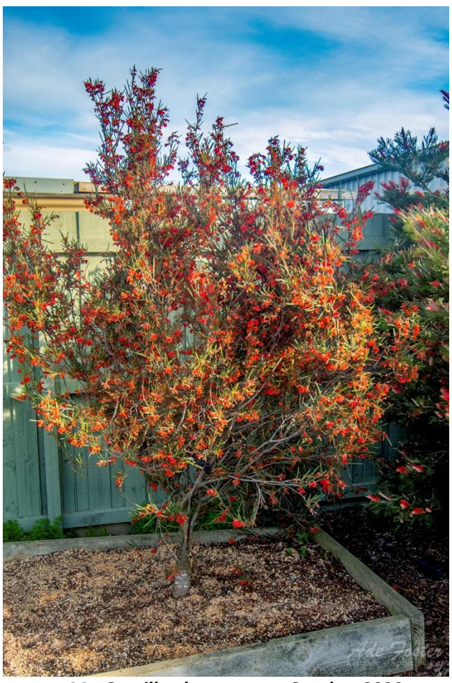
My Grevillea bronwenae, October 2020

It is a striking plant when in full flower and the richness of the flower colour seems to light that corner of the garden.