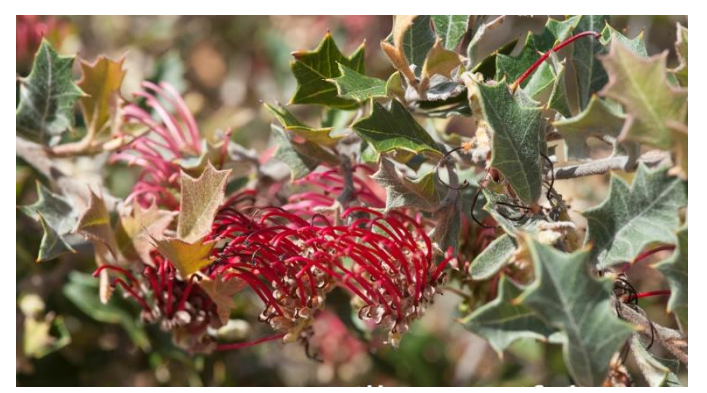
Grevillea aquifolium - Grampians

mostly red. Leaves are hard and holly-like with shrply pointed tips.