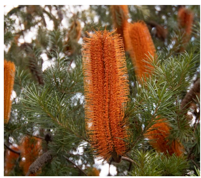
A B. ericifolia hybrid - Giant Candles

shrub with almost spherical deep purple flowers. B. candolleana, the Propellor Banksia is a shrub with long zig-zag leaves and orange/yellow flowers. B. squarrosa is a tall, prickly shrub with long leaves that have sharply pointed teeth down each edge. It has yellow, almost thistle-like flowers and is endemic to the south-west of WA. Banksia ericifolia is a NSW endemic and a really striking specimen tree. It can grow to about 7 metres but features very large, cylindrical orange flower spikes up to 30cm long.