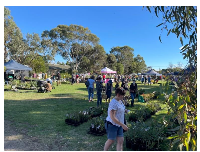
The 2022 sale in bright sunshine

The weather was perfect and the crowds arrived early. There were cars waiting at 8:00 am and the sale didn't start (officially) until 8:30. By 9:30 the car-park was full and there were cars parked on the road. There was a steady stream of visitors until about 1:30 pm when things started to slow down a bit.