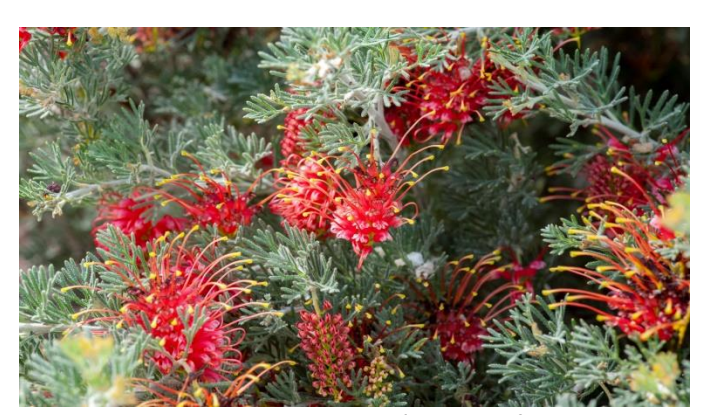
Grevillea priessii 'Seaspray'

Grevillea priessii ssp glabrilimba is a low-growing shrub grey/green foliage and masses of deep red flowers. It is found on the coastal plains of WA from Cervan3tes to around Eneabba. A very hardy plant, it is sold in nurseries as Grevillea 'Seaspray'.