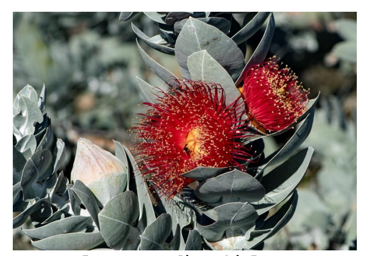
E. macrocarpa.

Eucalyptus macrocarpa, is endemic to the south west of Western Australia where it enjoys well drained soils and a Mediterranean climate.