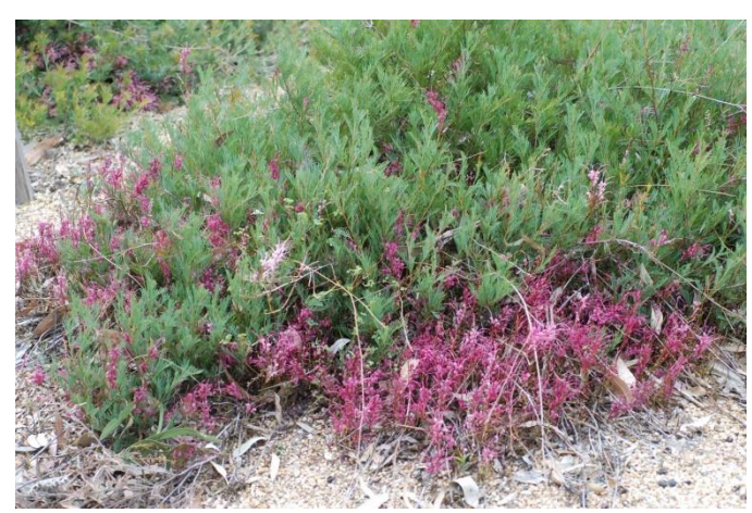
Grevillea plurijuga subsp. plurijuga

Grevillea plurijuga is an interesting plant with two subspecies, soon to become true species. The coastal subsp plurijuga is a prostrate plant with flowers on the end of long trailing stems. The more inland subsp. superba is an upright shrub with paler pinkish flowers. Subsp. plurijuga is common as a standard and makes a superb specimen plant.